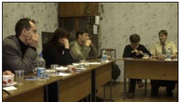
Alumni round table in Tomsk

On December 1, a round table discussion took place on December 1 during which alumni discussed common problems or positive results associated with implementing experience gained during internships in the U.S.