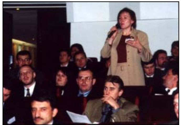
Questions from the audience