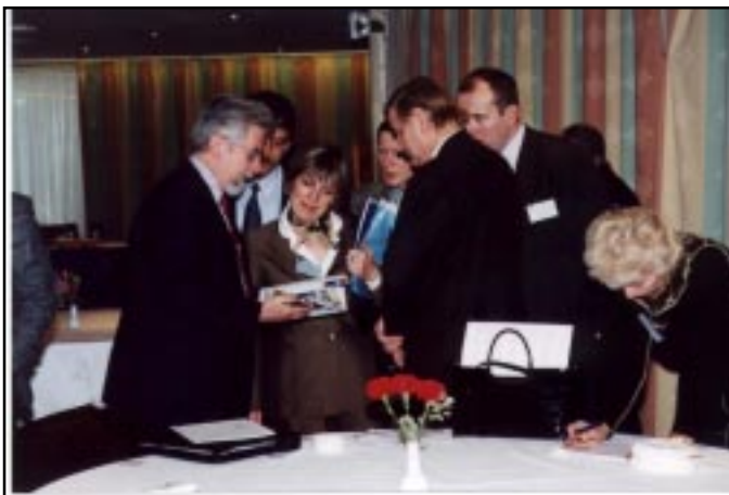
Discussions at the coffee break