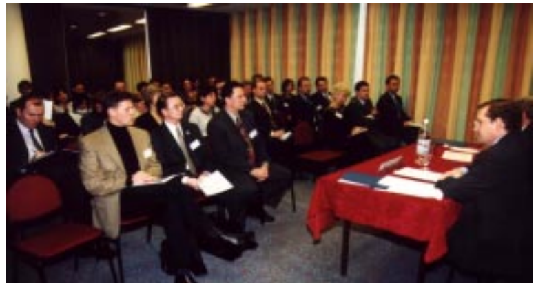
Alumni conference participants listen to presenters

On November 30 and December 1, the Business for Russia Alumni Conference was held for alumni from the Moscow City and Oblast. This was the first time that a conference of this size was organized for BFR alumni. Over 130 alumni attended the conference and among them were participants from other business training programs as well: over 40 alumni of the Presidential Management and Training Initiative (PMTI); four alumni of the Special American Business Intern Training Program (SABIT), run by the Department of Commerce; and four alumni from the Productivity Enhancement Program (PEP), which is run by the Center for Citizens Initiatives (also funded by ECA).