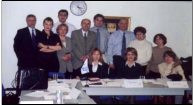
BFR group from Syktyvkar, Komi Republic