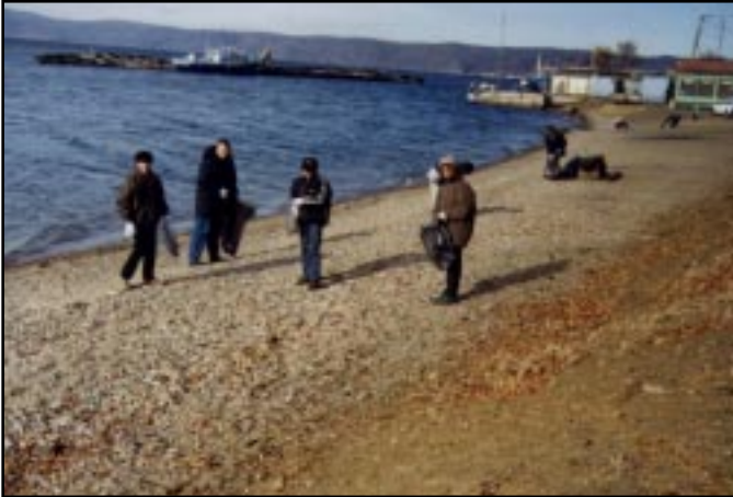
CCR alumni from Irkutsk cleaning the beach of Lake Baikal during Community Service Day