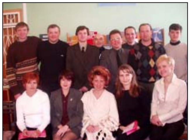
Seminar on effective business management in Volgograd

If you have an idea for a seminar, contact earsentieva@irex.ru .