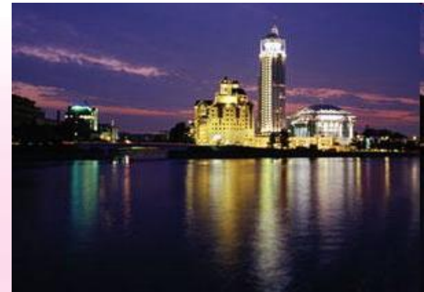
Swissôtel Krasnye Holmy Moscow