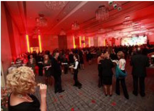
Grand Ballroom of Swissôtel