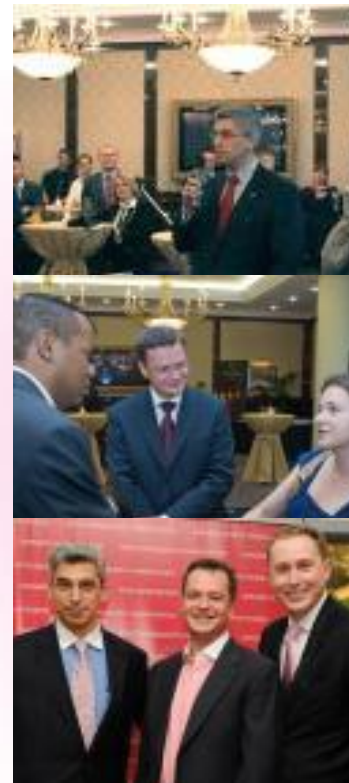
Harvard Club of Russia