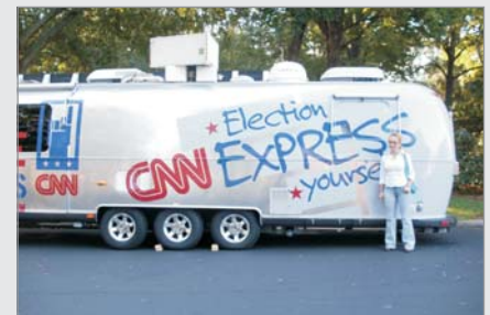
Ophelia Minasyan in front of CNN's "Election Express."